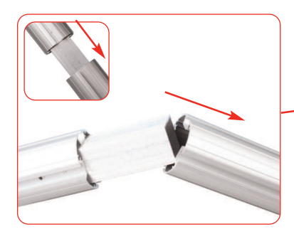
Align and slide female post over male post.

Position & angle holder to suit, tighten both thumb fasteners to secure the holder to the post. Repeat step for remaining holders.