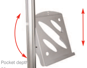
20mm approx (weight 1.5kg approx)

Vertical position and angle of the leaflet holder can be adjusted