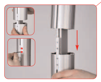
Align and slide female post over male post, tighten both grub screws using a 2mm allen key.

Important: Once frame is complete apply steel tape around the frame and PVC extrusion