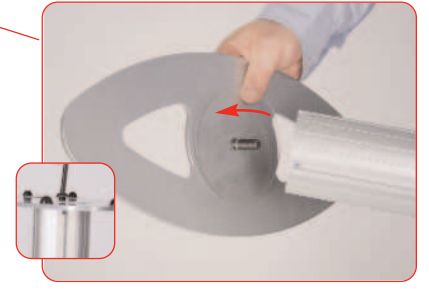
Attach base to male post using M10 bolt and allen key. Ensure clear washer is between base & post. Repeat step for 2nd post.